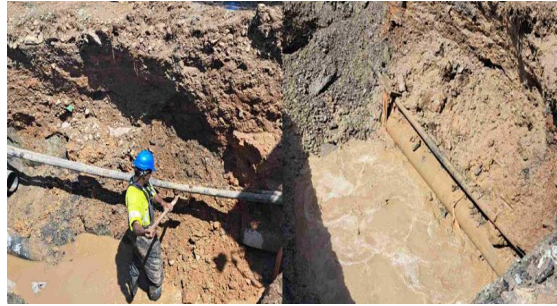
Denarau Island Infrastructure Upgrade