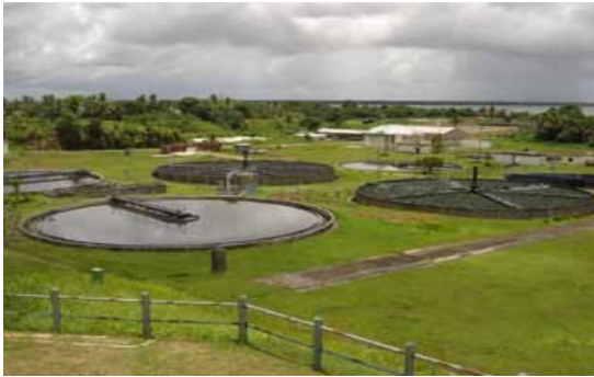
Kinoya Wastewater Treatment Plant