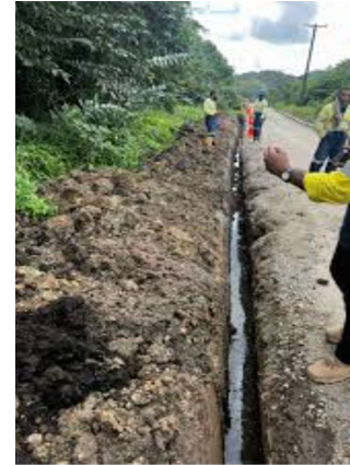
Elevated Princess Road Water Infrastructure Project