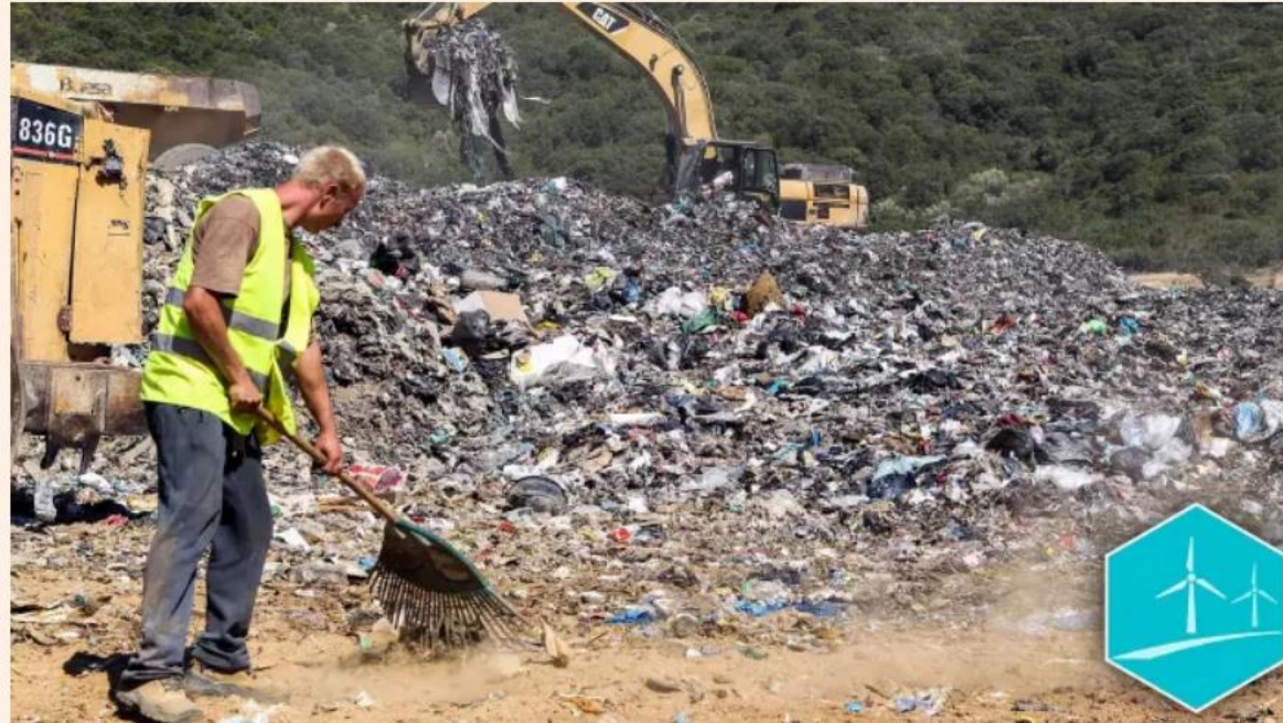
Europe's more than half a million landfill sites could be mined for energy and minerals

Waste can now be mined for metals and to create fuel